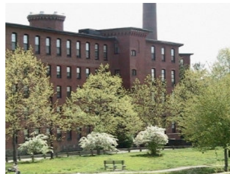
Our 1814 textile mill is a special place for a memorable party!