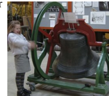
Kids love our hands-on exhibits and activities!

DJs, decorators, and other party pros to make your event a success!